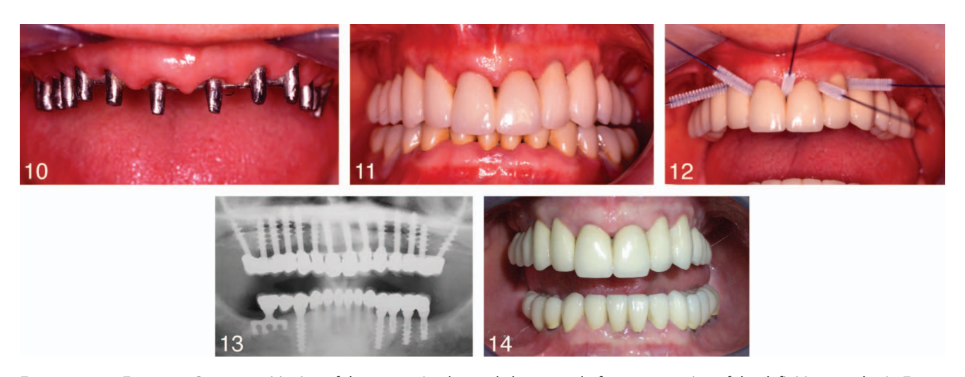
FIGURES 10–14. FIGURE 10. Correct positioning of the supporting bar and abutments before cementation of the definitive prosthesis. FIGURE 11. Full-arch, gold-ceramic maxillary prosthesis after insertion. FIGURE 12. Oral hygiene procedures are demonstrated to the patient. FIGURE 13. Thirteen-year follow-up radiograph shows preservation of bone surrounding all of the implants. FIGURE 14. Thirteen-year follow-up intraoral photograph shows healthy appearance of the oral mucosa.

also be used with implant abutments and submerged implants. Among the advantages of intraoral welding are immediate stabilization of the implants, immediate provisionalization, reduced risk of failure during the healing period, elimination of errors caused by unsatisfactory impression-making, and a potential reduction in patient complaints and discomfort.