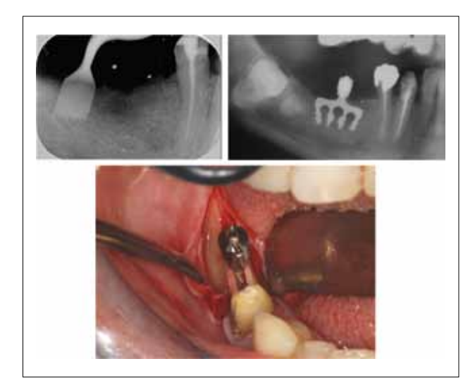
FIG. 2 A The serrated insert working in depth. B Profile of the polimorphic blade with Pasqualini's screw abutment, just inserted. C Osteotomy with the correct insertion of the implant.